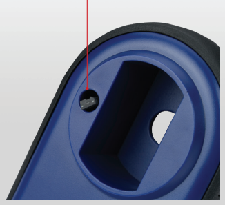
XP200 NOT INCLUDED